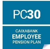
Pensions Caixa 30