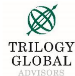
Trilogy Global Advisors, LP